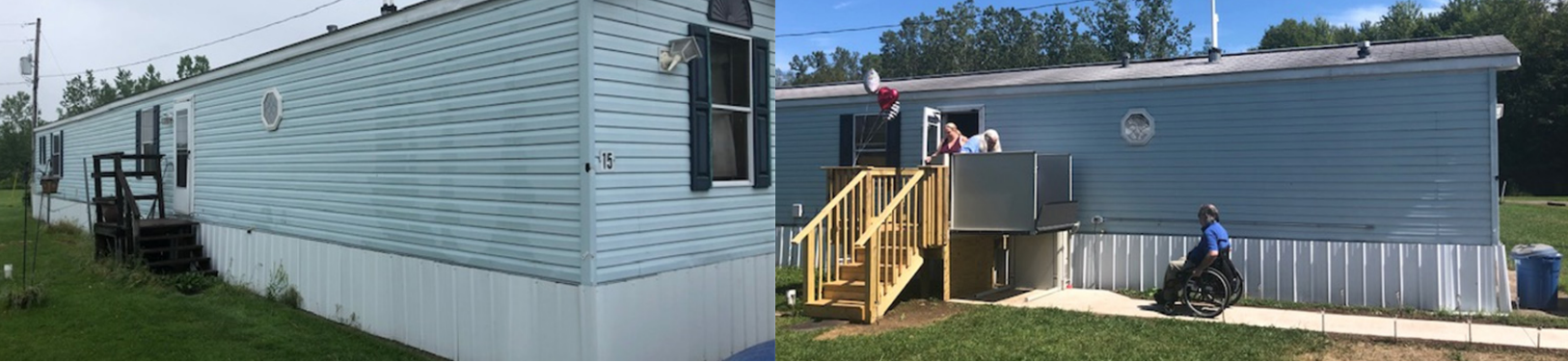
Gasport project: before