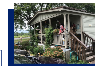
Batavia project: before

EBHNY is a two-year pilot program designed to remove barriers to housing choice throughout the State of New York. The EBHNY program is funded by settlement payments secured by the New York State Attorney General’s Office from major mortgage lenders over fraud and misconduct that contributed to the housing and foreclosure crisis of the 2000s. HOME is one of six agencies in the state that received funding through this program, and we were given the latitude to develop projects that would have a significant impact on our community. As a result, we designed our program to address critical areas of housing need and to respond to service gaps in Western New York. To achieve this goal, HOME focused its efforts on three main programmatic pillars: fair housing enforcement, education and outreach, and accessibility modification.