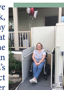
Batavia project: after