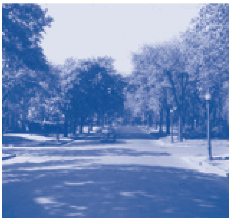
Figure 5 Humboldt Parkway at Northland in 1953.

The prevailing segregation and inequality we see in our region today are the consequences of decades of public and private policies. Similarly, breaking down the barriers to opportunity and moving our region towards a more just and inclusive society will require the combined efforts of people, businesses, and governments. One of the first steps on this path occurred in 1963, when HOME was formed by a group of concerned citizens to combat discrimination and segregation. Five years later, the passage of the federal Fair Housing Act outlawed redlining, steering, and other discriminatory practices by housing providers and lending institutions. In the fifty years since the passage of that landmark legislation, New York State and the municipalities of Buffalo, Hamburg, and West Seneca have passed their own fair housing laws that provide additional protections against discrimination. However, much work still remains. Today, HOME remains dedicated in the fight to ensure all people equal access to the communities and resources necessary to build wealth and create strong, vibrant communities. Join with us today to reverse-engineer Western New York's persistent geography of segregation. ■