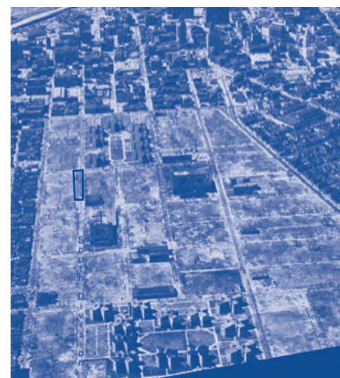
Figure 4. Aerial view after wide-spread demolition and construction of Ellicott Mall (top) and Douglass Towers (bottom) in 1961. The blue rectangle is the approximate location of the previous photographs.