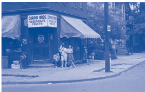
Figure 2. 288 South Division Street and Pine Street in 1954.

In the 1930s, New Deal-era housing programs and agencies were created to address the housing crisis caused by the Great Depression. Unfortunately, these programs were administered in a way that institutionalized racism and segregation throughout the housing industry for decades. The Public Works Administration built public housing that was strictly segregated. The Home Owners Loan Corporation (HOLC) created "security maps" that color-coded credit worthiness of neighborhoods according racial or ethnic composition – a policy that would later be termed "redlining." The Federal Housing Administration (FHA), building on HOLC's maps and guidelines, established underwriting standards that discriminated against minority neighborhoods. After World