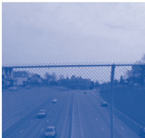
Figure 6. The Kensington Expressway today.