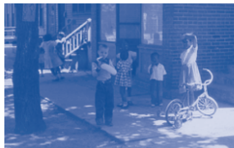
Figure 3. 333 South Division Street in 1954.

War II, the Veterans Administration adopted and perpetuated these policies of racial exclusion, refusing to insure mortgages for African-American veterans and their families to buy houses in white neighborhoods and communities. As a result, African-Americans only received two percent of all federally insured home loans between 1945 and 1959. These policies effectively excluded people of color from the path to prosperity available through homeownership and access to capital.